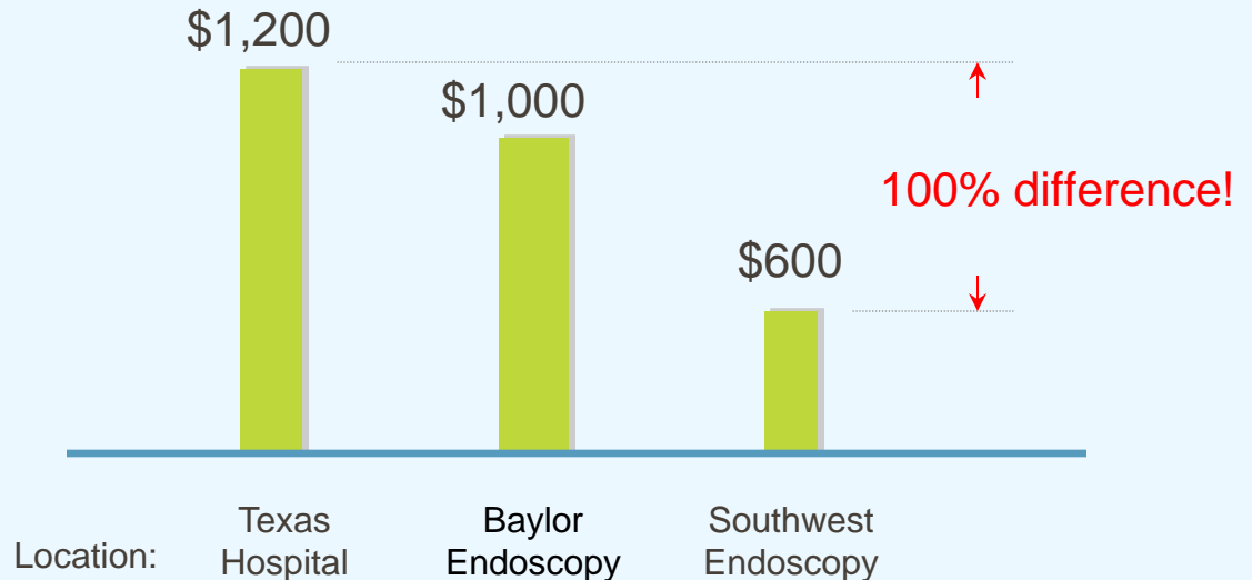
Cost of Colonoscopy - Dallas, TX

Doctors and hospitals have different fees for the same medical services.