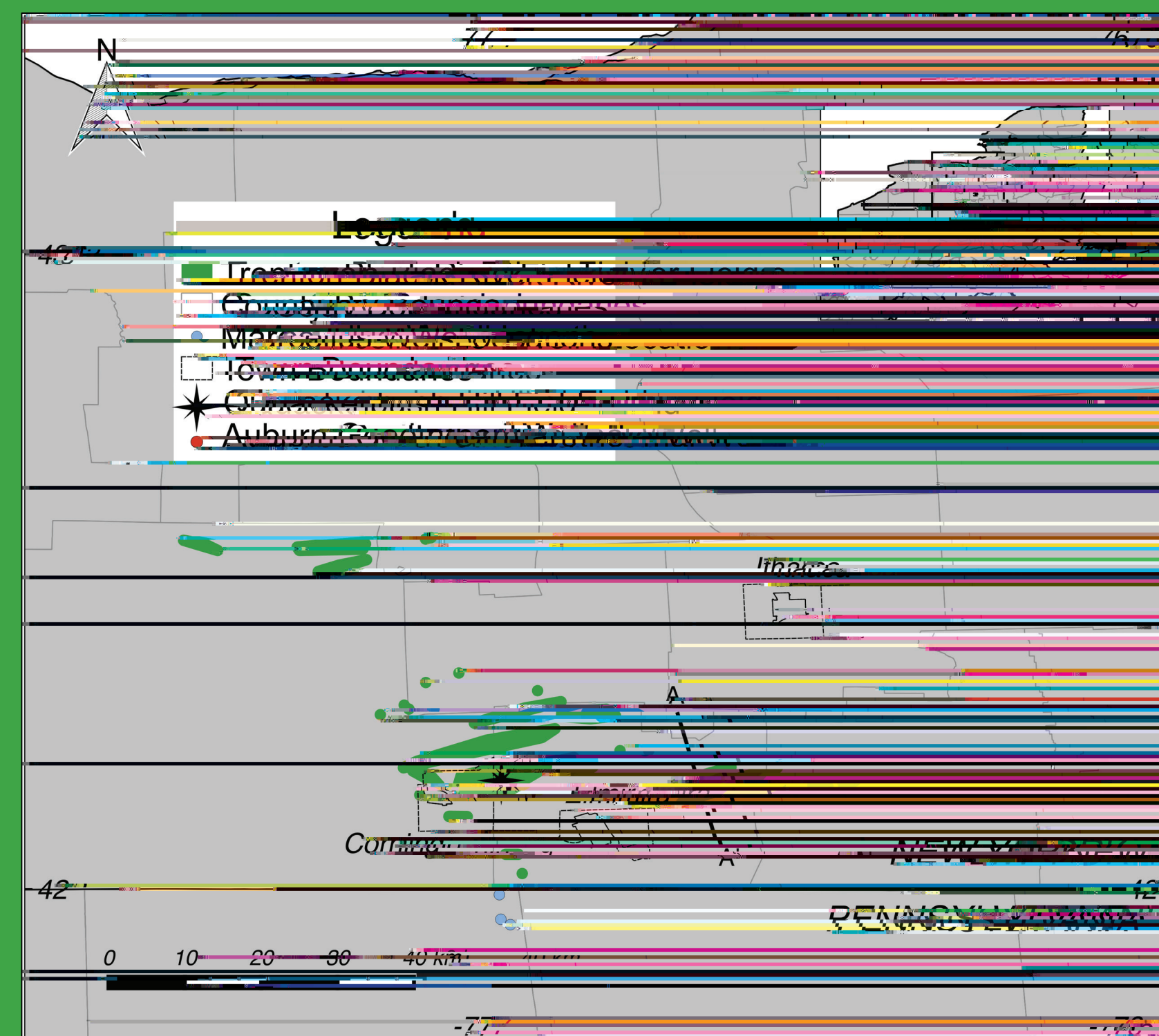
Figure 1. (left)

Map of the Trenton-Black River fields in southern NY. These fields strike WNW to west. Cross section A-A' is shown in Fig. 2. This work's research is conducted on Quackenbush Hill field, shown in this map by the black star, near Elmira and Corning.